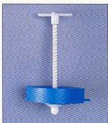
Non Spill Valve

No Spill Valve: Allows the bottle to be charged without spillage. The valve automatically opens and closes to release water only when required. (Fits most 8, 11, 15 & 19 litre bottles).