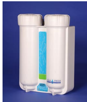
Reverse Osmosis portable unit